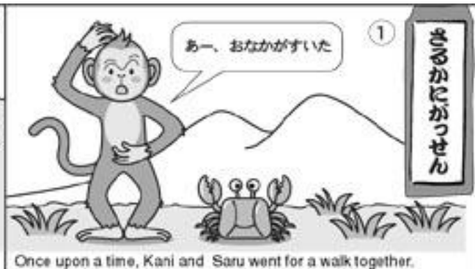
Once upon a time, Kani and Saru went for a walk together.