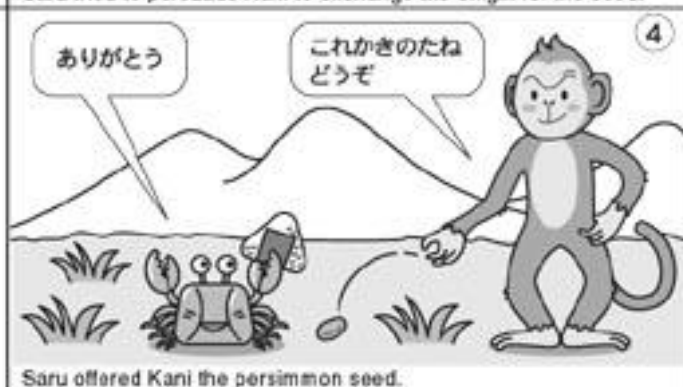
Saru offered Kani the persimmon seed.