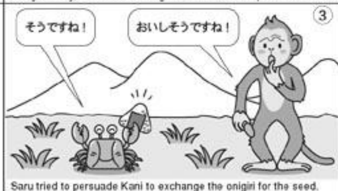
Saru tried to persuade Kani to exchange the onigiri for the seed.