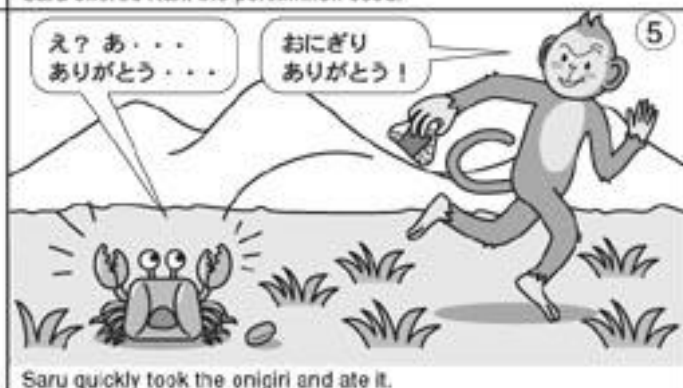
Saru quickly took the onigiri and ate it.