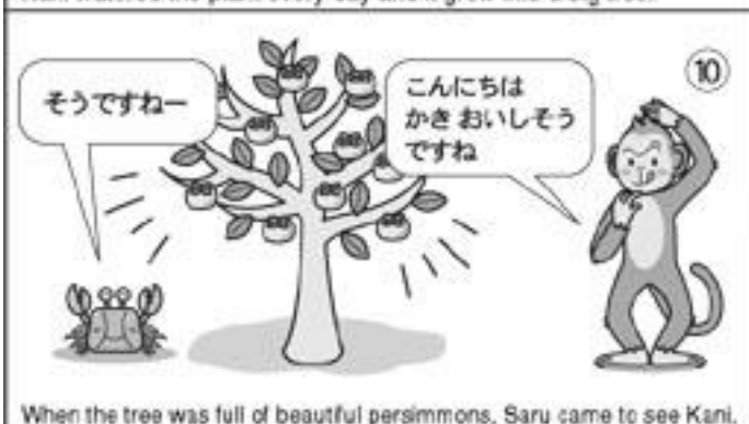
When the tree was full of beautiful persimmons, Saru came to see Kani.