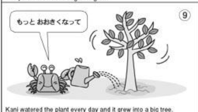
Kani watered the plant every day and it grew into a big tree.