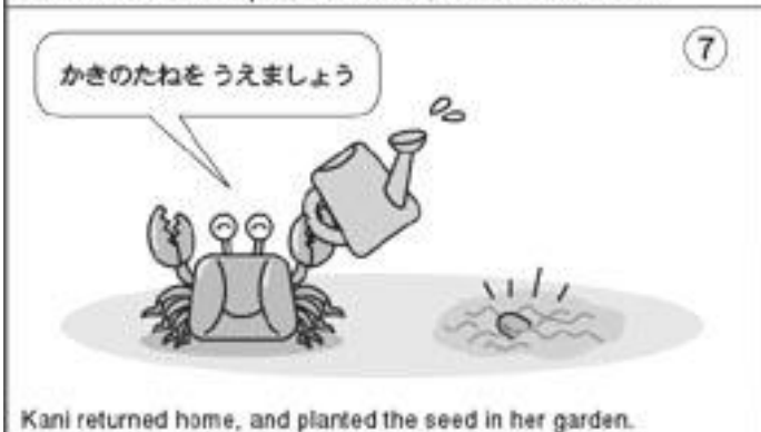
Kani returned home, and planted the seed in her garden.