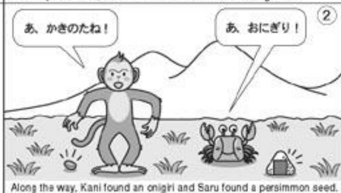
Along the way, Kani found an onigiri and Saru found a persimmon seed.